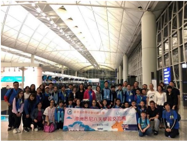
Let's go to Sydney! Hurray!