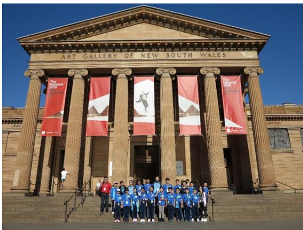
Art Gallery of New South Wales