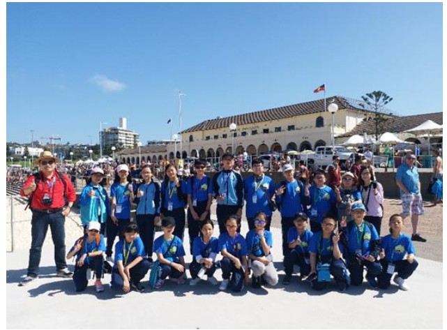
Lovely Bondi Beach!