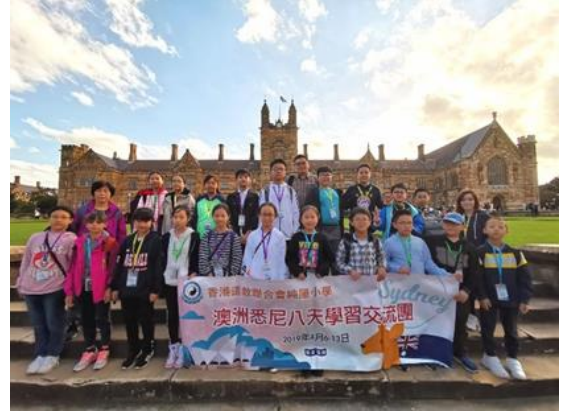
The best university in Australia – University of Sydney