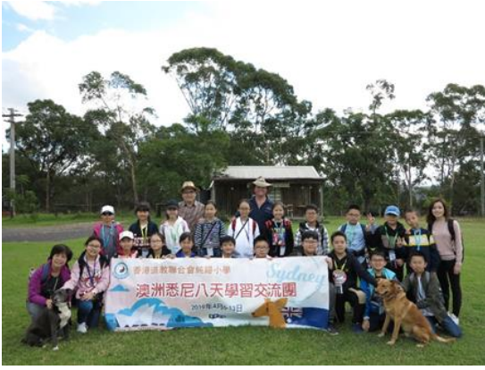
Cow boy! Sheep dogs! We are at the Tobruk Sheep Station.