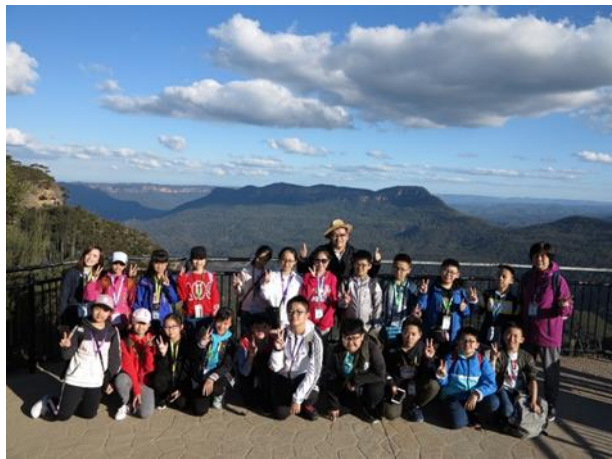
The view at Blue Mountain is so magnificent!