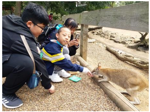
The kangaroo is so lovely.