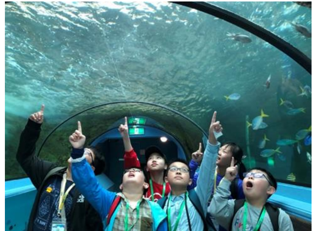
Wow! What a big cloud of fish above our heads!