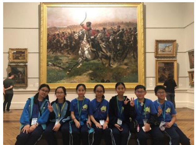
What a great picture! I've never seen it before.