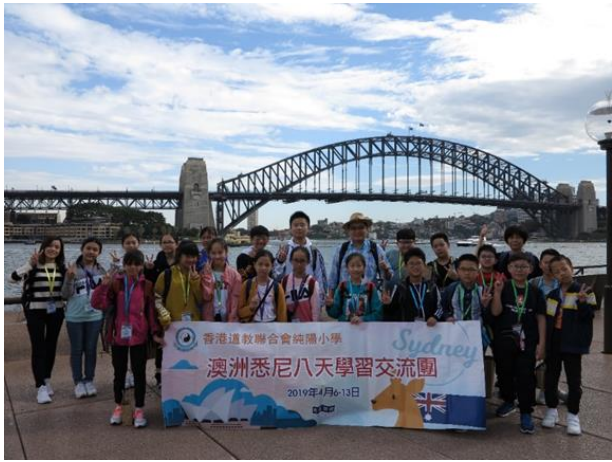
The most famous tourist spot in Sydney – Harbour Bridge