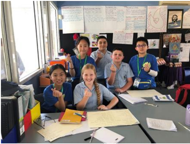
It means "LOVE"! We are friends.