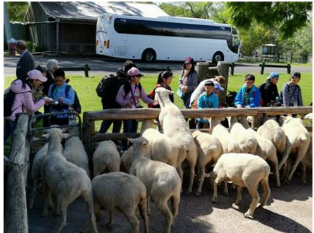
Have a lunch, sheep! You are so cute.