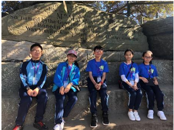
There's a romantic story of the Mrs. Macquarie's Chair.