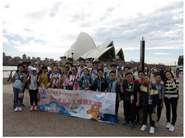
We hope we can perform at the Sydney Opera House one day!